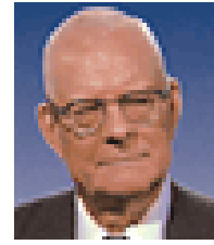
W. Edwards Deming